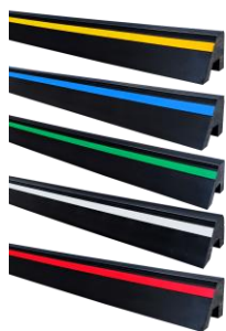
5 colour options for safety strips

WARNINGS: • Wheel Stops must be securely affixed to the ground to inhibit upward curving at the ends, as all plastic expands/contracts. See Installation Instructions • For use on flat surfaces only • Wheel stops should not be used where they may be in the path of pedestrians moving to & from parked vehicles or crossing a car park for any other purpose • Always perform your own risk assessment before using this product • Warranty against chipping, rusting, rotting and disintegrating, under normal conditions, with proof of purchase. Excludes fixings & installation • Copies of Technical Data Sheets available upon request