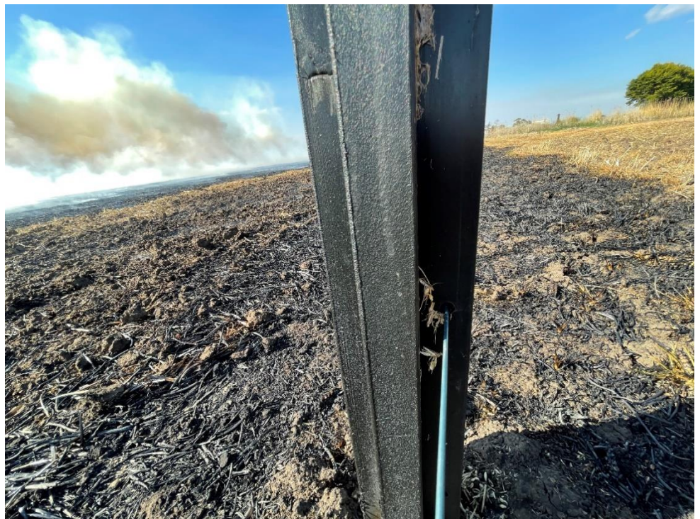
PLUS Posts - After a grass fire