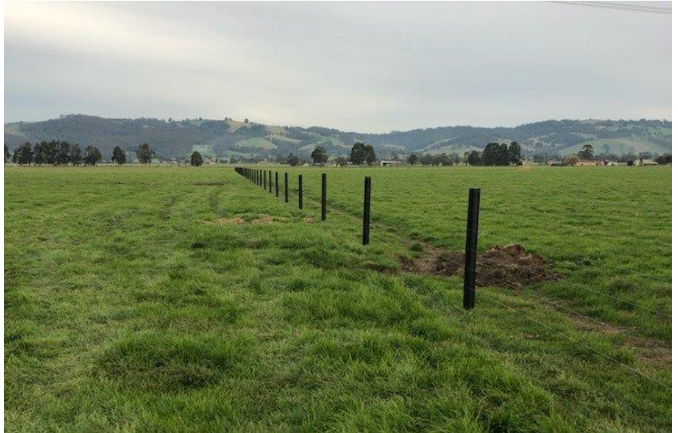
PLUS Posts - Before a grass fire