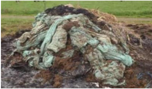
Used silage wrap

The Choice - Leave a problem for your kids?